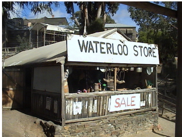
Sovereign Hill's Waterloo Store